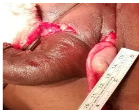
Fig. 5. Right and left testes in sub-dartos pouch.

All patients had single stage orchidopexy in the subdartos pouch (Fig. 5) or orchidectomy.