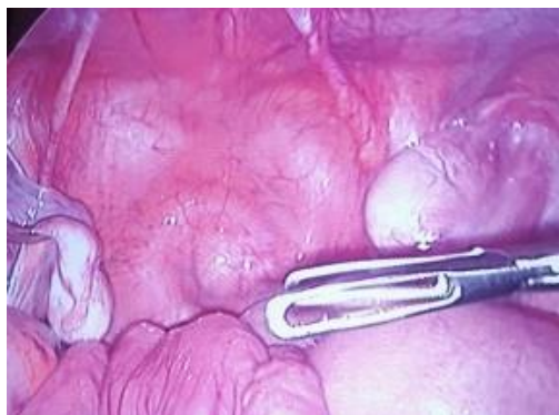
Fig.4. Right peeping and left intraabdominal testis.

All patients had single stage orchidopexy in the subdartos pouch (Fig. 5) or orchidectomy.