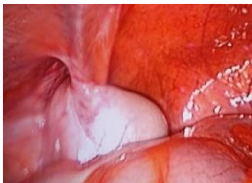
Fig. 3. Left intraabdominal testis.

The laparoscopic location of presence or absence of the testes were noted (Fig. 2, 3, and 4).