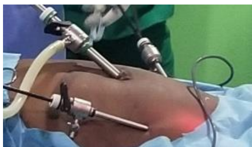
Fig. 1. Ports for laparoscopic orchidopexy or orchidectomy.

All patients had general anesthesia with appropriate endotracheal intubation. The carbondioxide pneumoperitoneum was created using a Verres needle and the intraabdominal insufflation pressure was 8-12mm and 15-18mm for children and adults. The primary trocar port was 10mm while two secondary ports of 5mm each were introduced at midpoint of ilio-umbilical line (Fig. 1).