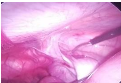
Fig. 2. Right intraabdominal testis.

The laparoscopic location of presence or absence of the testes were noted (Fig. 2, 3, and 4).